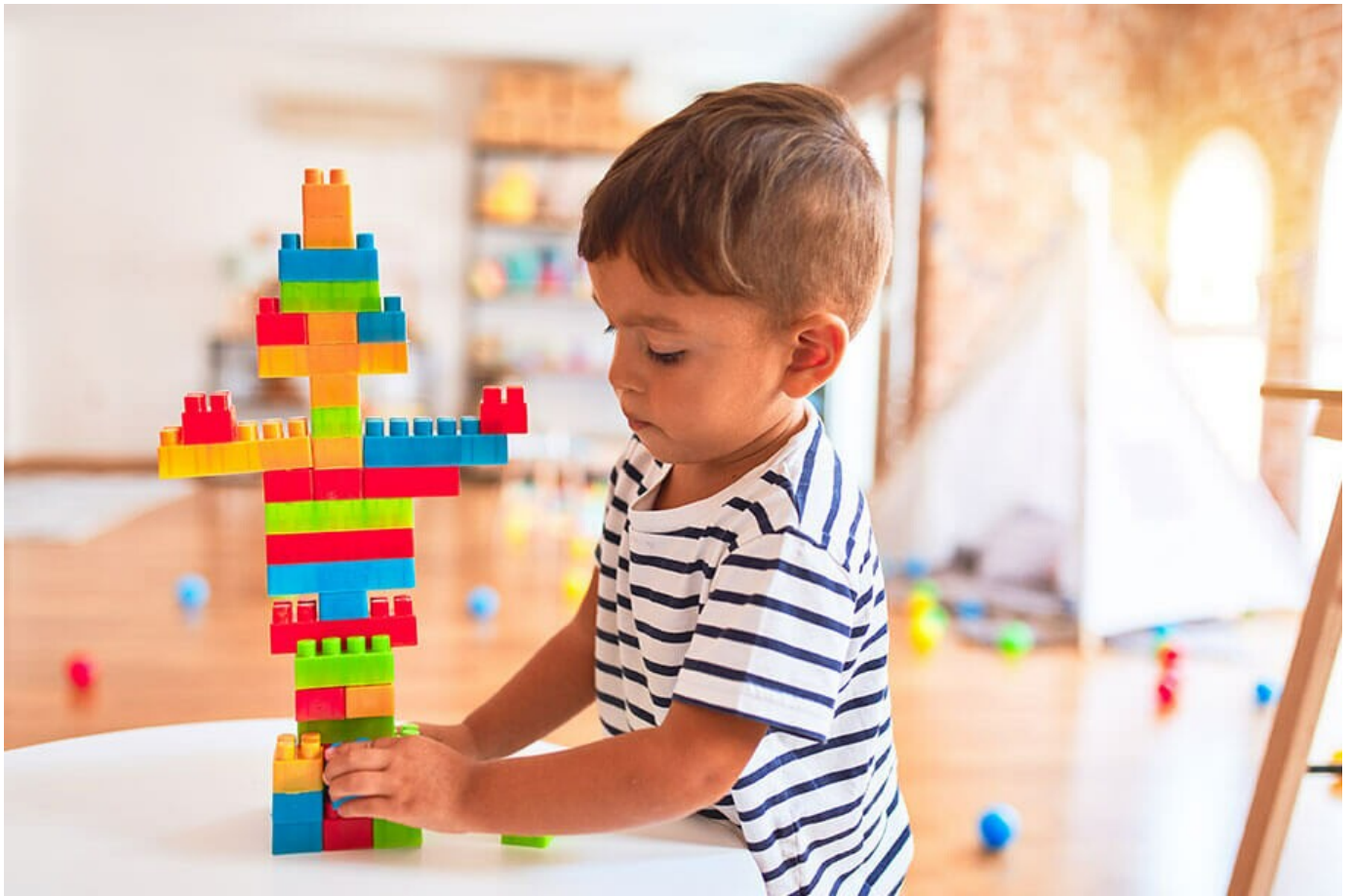
Age 3 Years