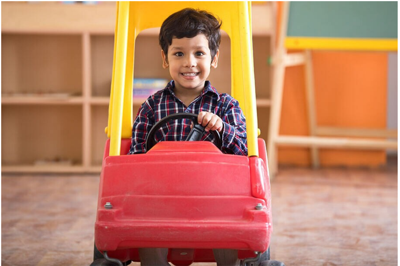
Age 4 Years