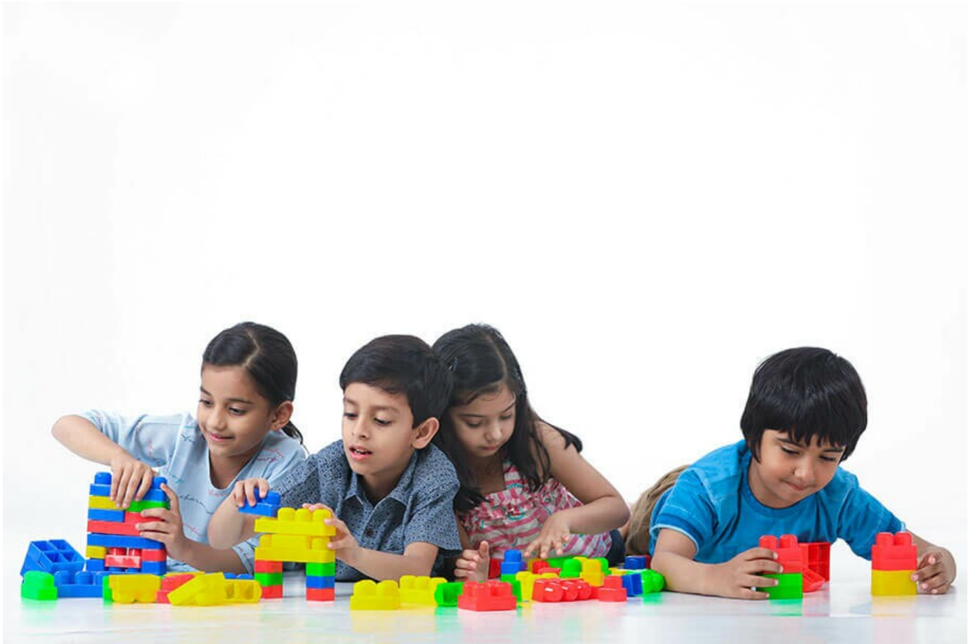
Age 5 Years